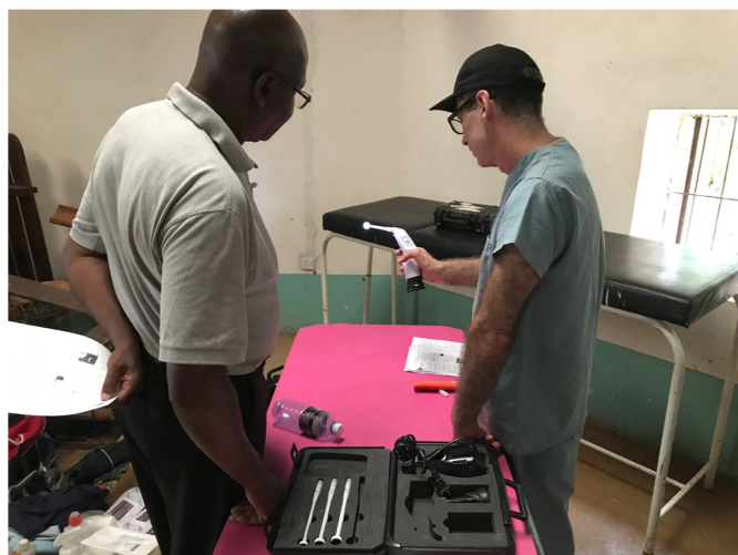
Figure 1 A Canadian family physician teaching a Kenyan obstetrician-gynaecologist how to use a portable thermo-coagulation device.

The cost of any novel therapy is always considered. Work by Maza and colleagues documents that most widely used cryotherapy devices have an estimated cost between $1700 and $2000, with additional tips costing approximately